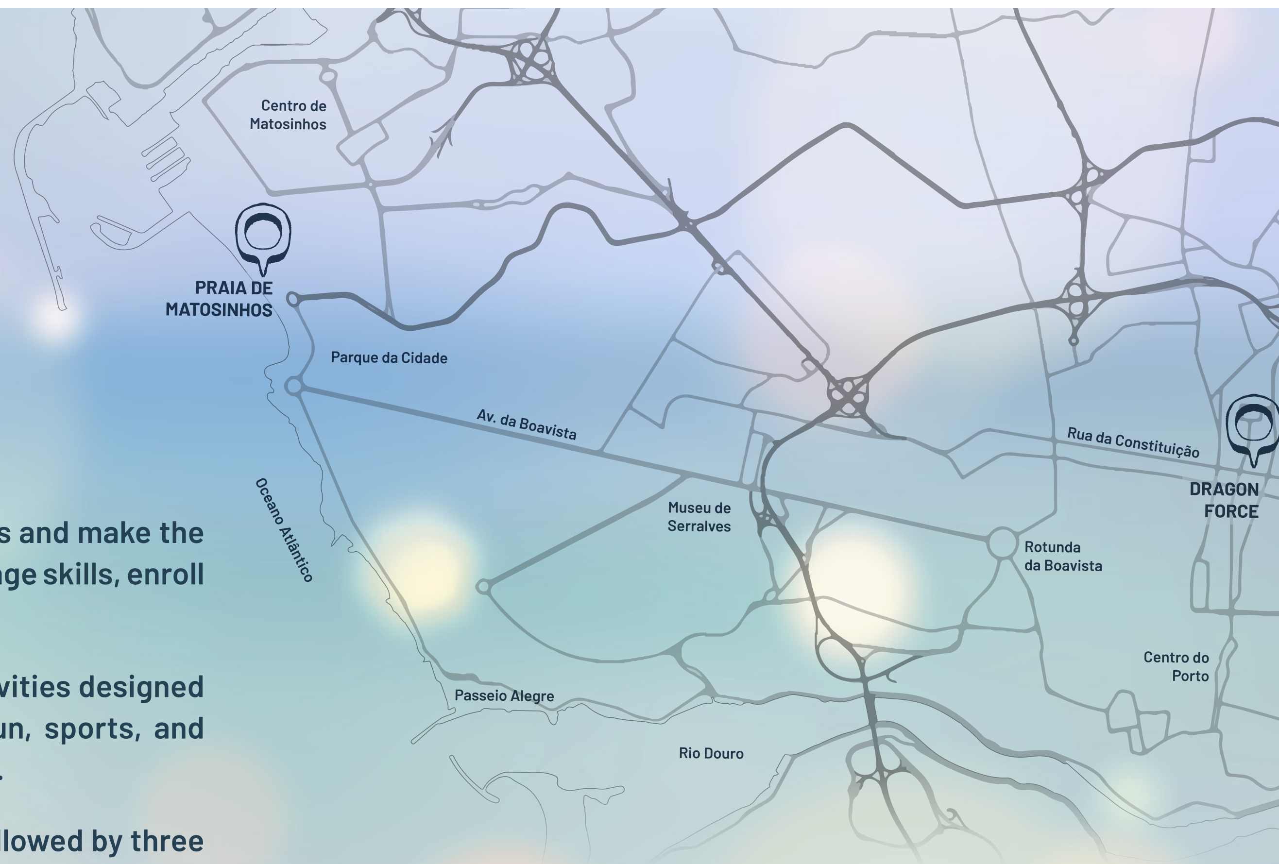
Porto Area City Map

Fill out the form and book your Summer Camp in Porto now to secure your place! You have until May 23 rd to register.